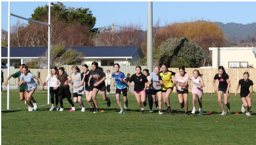
The race start for our Year 8 Girls in 2024

Please note dogs are not permitted at Te Atiawa Park.