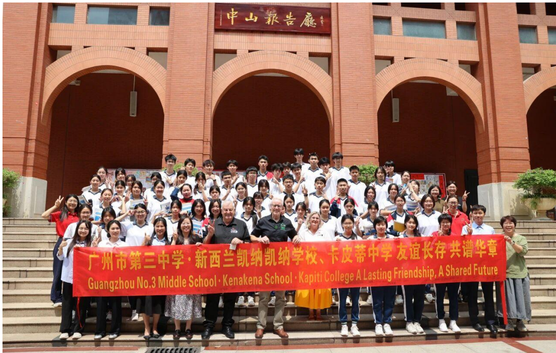
My visit to Guangzhou No.3 Middle School in Guangzhou.

Our immediate goal is to gain enrolments for our Premium Activities Programme at the beginning of next term.