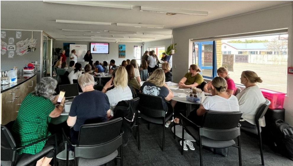
Our Kaiako at the March 20 Teacher Only Day - Maths Workshop

This was a very important workshop for all our teaching staff. Last year we spent time getting to know the maths curriculum through two changes, which were then followed by a third change near the end of the year. This workshop helped solidify our knowledge of the final version, be certain in our teaching of it, and be confident in our approach to assessment.