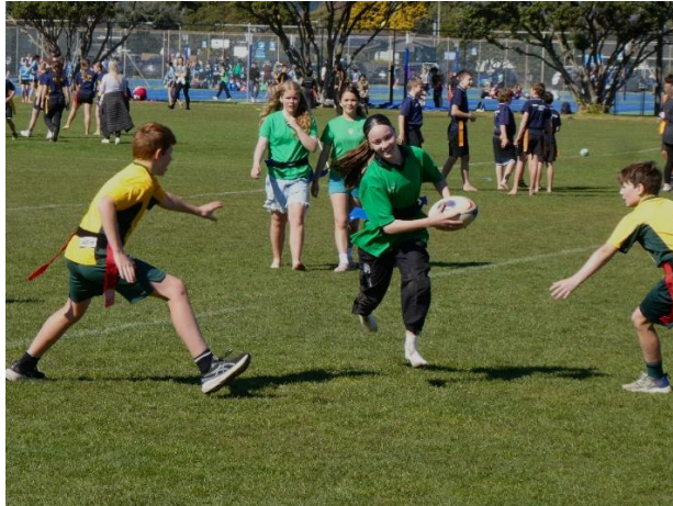
Action from last year's Senior Winter Tournament